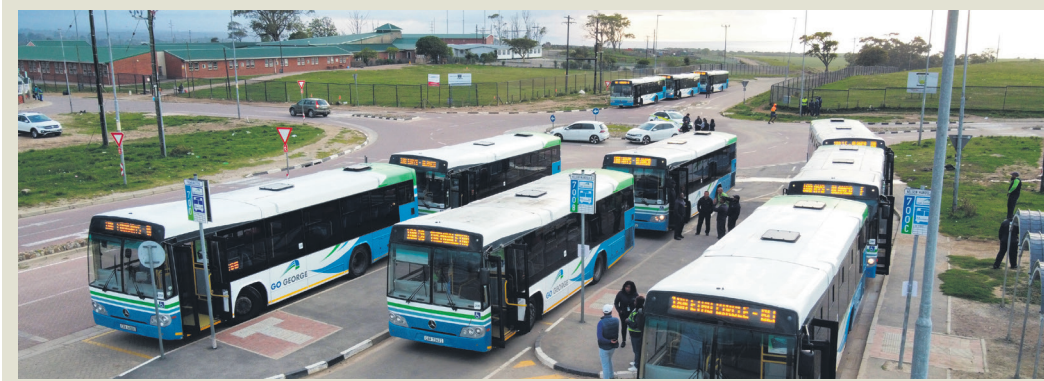
The bus terminus at the Jonga circle in Thembaletu is spacious and accommodates several buses waiting to depart. The buses make their turnaround to town at this circle.

be obtained by phoning the Call Centre toll-free on 0800 044 044, sending an email to info@gogeorge.org.za , or visiting www.gogeorge.org.za or the GO GEORGE Facebook page.