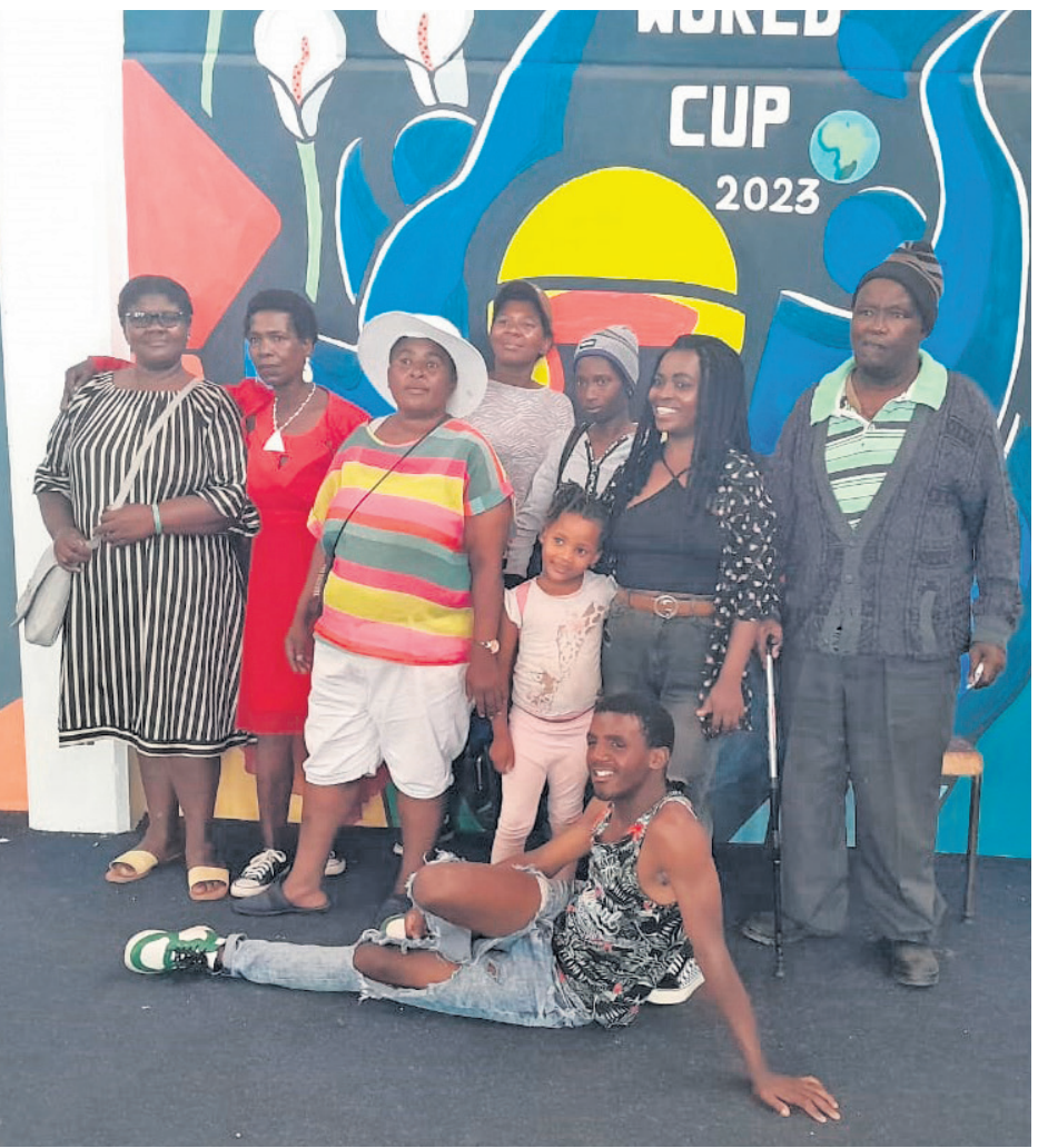
Some of the attendees of the World AIDS Day.