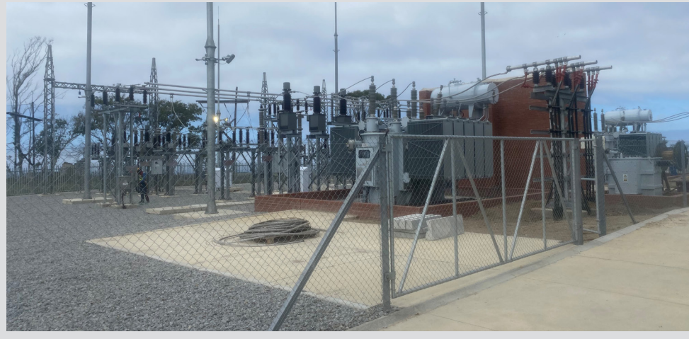
66-11 kV 20MVA power transformer in the foreground with auxiliary equipment installed.

Benefits of the New Substation ■ Provides reliable electricity to Thembalethu and enables future expansion.