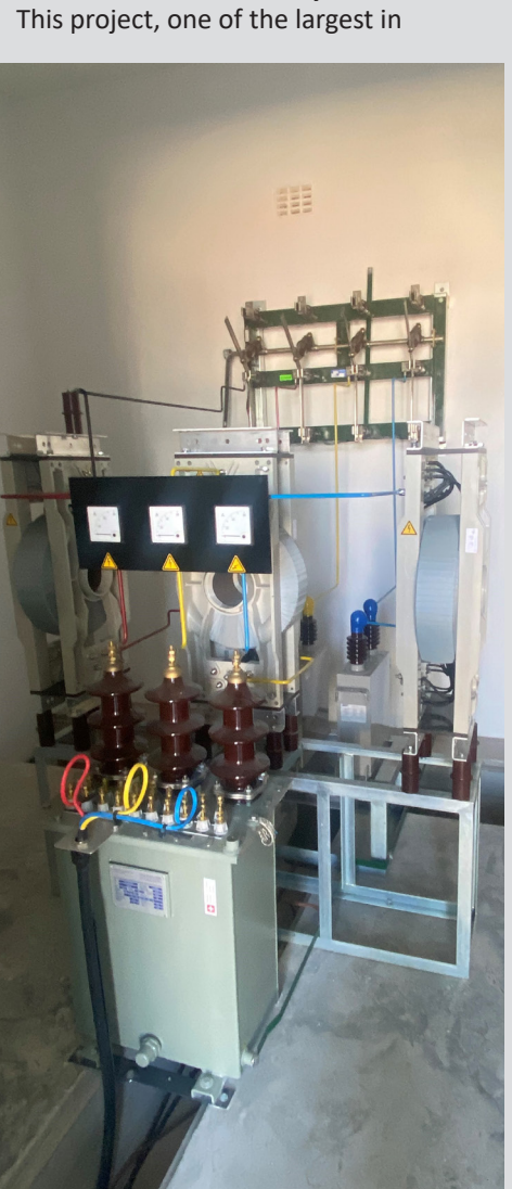
Ripple Control Coupling Cell to control municipal equipment.

The construction of the new 66kV substation in Thembalethu, aimed at bolstering power supply reliability in response to escalating electricity demand, is progressing gradually and is anticipated to be finalised within this year.