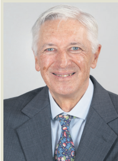
Ald Leon Van Wyk, Executive Mayor PR (DA)