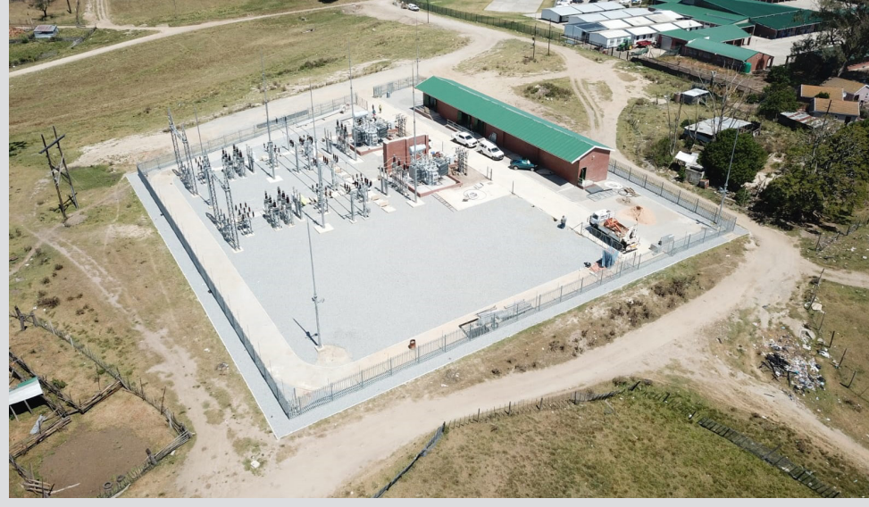
Aerial view of Thembalethu Substation.