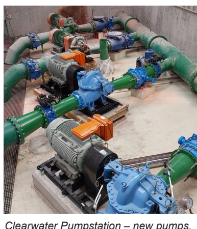
Clearwater Pumpstation – new pumps.