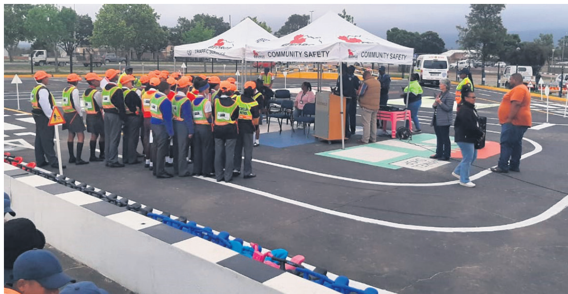
The George Traffic Department hosted a successful scholar patrol competition.